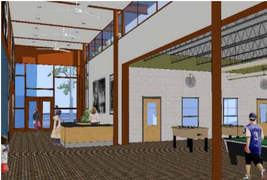
◀ Joe R. Lee Branch